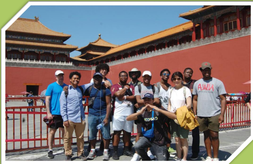
Morehouse students in Beijing, June 2019

Study Abroad Virtual Info Session Zoom Meeting ID 999 1870 8429