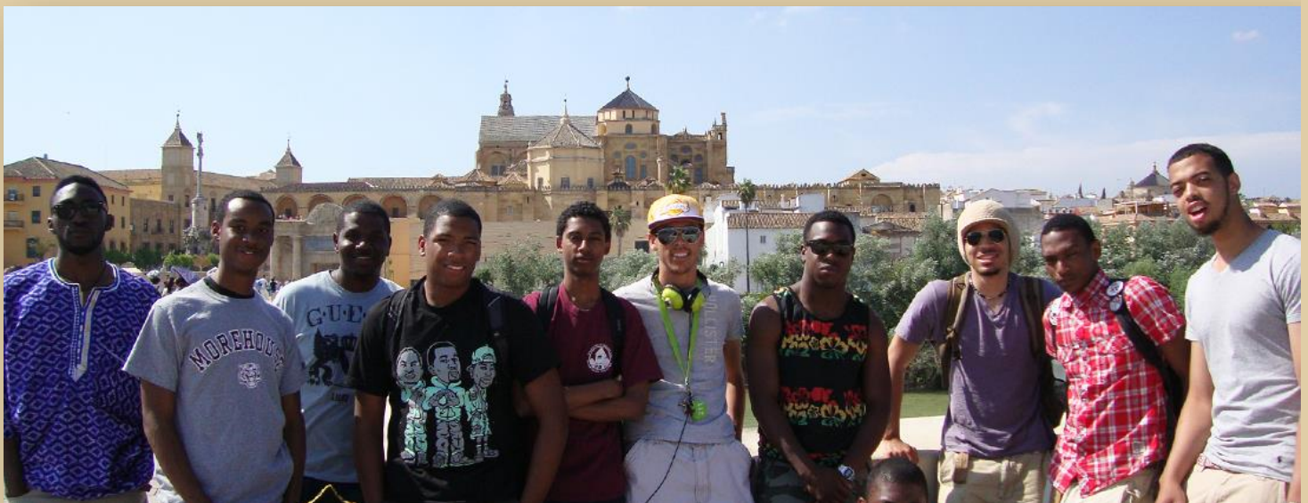
Morehouse Students in Spain

Study Abroad Virtual Info Session Zoom Meeting ID 999 1870 8429