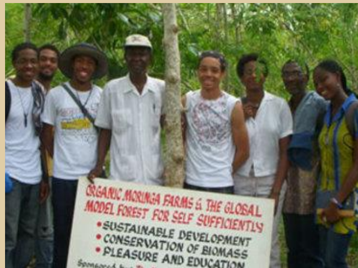
Morehouse Students in Africa

How to Afford Study Abroad Zoom Meeting ID 999 1870 8429