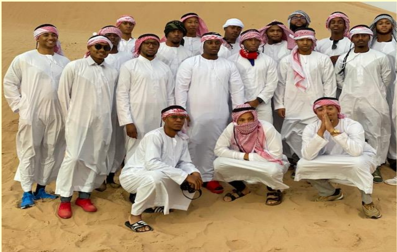
Morehouse students in Dubai. December 2019